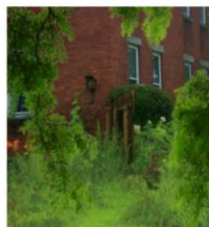
b) Visibility restored Image

Fog effect is the function of distance between camera and object. Hence removal of fog requires the estimation of air light map or depth map. The current haze removal method can be divided into two categories: image enhancement and image restoration. Image enhancement does not include reasons of fog degrading image quality. This method can improve the contrast of haze image but loses some of the information regarding image. Image restoration firstly studies the physical process of image imaging in foggy weather. After observing that degradation model of fog image will be established. At last, the degradation process is inverted to generate the fog free image without the degradation.