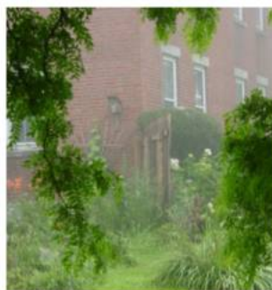
Fig.1.1 a) Hazy Image

Visibility restoration refers to different methods that aims to enhance the visibility of an image. The degradation may be due to various factors like relative object camera motion, blur due to camera misfocus, relative atmospheric turbulence and others. The image quality of outdoor scene in the fog and haze weather condition is usually degraded by the scattering of a light before reaching the camera due to large quantities of suspended particles (e.g. fog, haze, smoke, impurities) in the atmosphere. This phenomenon effects the normal work of automatic monitoring system, outdoor recognition system and intelligent transportation system. Scattering is caused by two fundamental phenomena such as attenuation and air light. By the usage of effective haze removal of image the stability and robustness of the visual system can be improved. Haze removal is a tough task because fog depends on the unknown scene depth information.